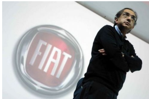
Sergio Marchionne, the CEO of the Fiat group.