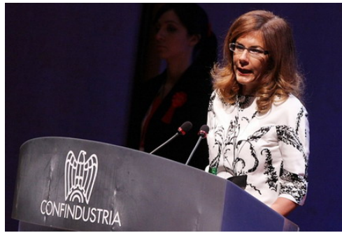
Emma Marcegaglia during a meeting of Confindustria.

Because of her firmness, Miss Marcegaglia has earned several friends, but also some enemies, including Sergio Marchionne, CEO of Fiat . In the past few months the two have been the protagonists of a wild debate. At the core of the argument, among several other things, there was the Italian Parliament's approval of the article #8 of the financial maneuver that introduces instruments of flexibility in the workforce. Fiat, Marchionne declared, immediately expressed great appreciation for this measure that "has resolved several key issues with the unions, thus guaranteeing the necessary certainties for the economic development of our country, but, with the signing of the inter confederal agreement of September 21 a debate has sprung that has highlighted its contradictory positions and has reduced the expectations of the article #8." For this reason Fiat decided to leave Confindustria. At first Marcegaglia reacted by saying that "Confindustria respects freedom of choice." There is who believes that, with Fiat's exit, the president will find herself alone in the association she is controlling.