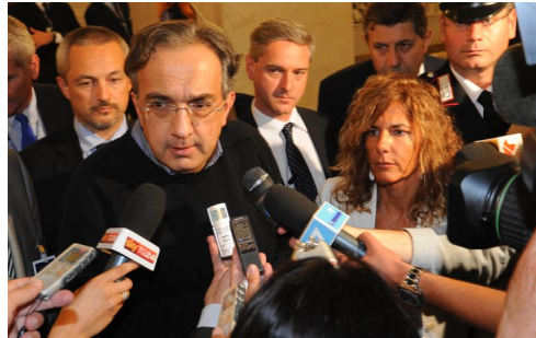
Emma Marcegaglia with Sergio Marchionne.