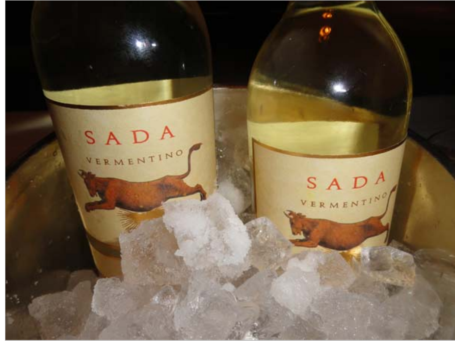
Tuscan Wine and Food the Perfect Combination