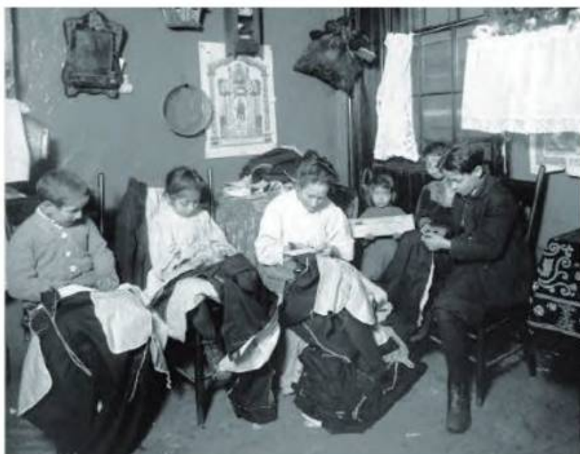
An Italian immigrant family in Little Italy, Chicago 1930